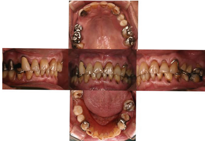
FIGURE 1: Oral view at the first visit.

instruction, and counseling. Additionally, dental treatment may be necessary to correct faulty restorations that could contribute to poor oral health [12].