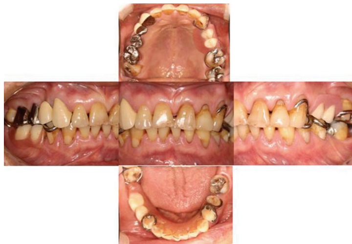
FIGURE 3: Oral view after treatment.

While these may have been partially effective, the patient's breath odor did not change perceptibly. There was no pain and no periapical lesions, so the patient's endodontic problem may not have been readily apparent. Fortunately, the main cause of his oral malodor was finally identified and treated. After the root canal filling, the OLS decreased to 2, which confirmed that endodontic problem was one of the main causes of his oral malodor. We did not measure with gas chromatography at this stage, because it takes much time to perform the complete breath odor measurement and the organoleptic test is considered reliable and important [11, 12].