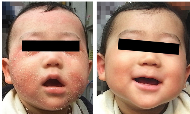
Figure 2 An infant with moderately severe atopic dermatitis (left).

Note: The patient did not use TCS and 4 months later was assessed as being in remission.