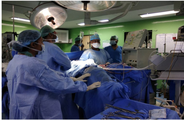
Fig. 5 HIPEC in progress

cases, some surgeons also perform CRS and HIPEC through a minimally invasive approach depending on the expertise.