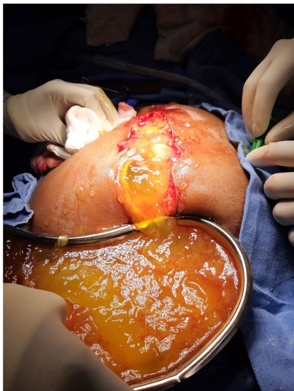
Fig. 2 Mucinous ascites being drained on laparotomy