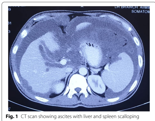
Fig. 1 CT scan showing ascites with liver and spleen scalloping

As far as Peritoneal Cancer Index (PCI) is concerned, unlike in other PSM, APM does not follow the rule. Even in high PCI, optimal cytoreductive surgery (CRS)