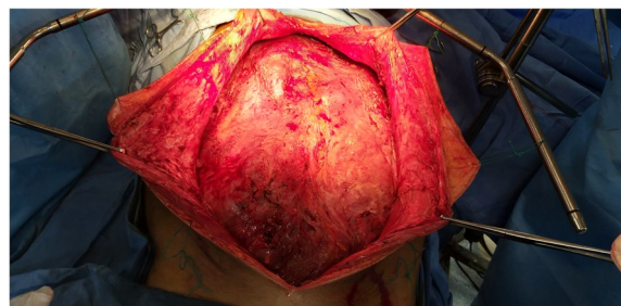
Fig. 4 Extraperitoneal approach for CRS and HIPEC

We prefer an extraperitoneal approach with an incision from the xiphisternum to symphysis pubis under general anesthesia in a modified lithotomy position (Figs. 2, 3, 4). We perform radical appendectomy, including removing lymph nodes caecotomy for clear margin or limited hemicolectomy as per the intraoperative assessment. No literature suggests that hemicolectomy yields better survival. We routinely remove all quadrant peritonectomy with an extraperitoneal approach, total greater and lesser omentectomy, and all the deposits over mesentery. Sometimes we perform partial gastrectomy, sigmoidectomy, and anterior resection to achieve complete CRS. We perform Gleason capsulectomy from the liver surface or by Hook technique to remove the scalloping over the liver and spleen. We sometimes