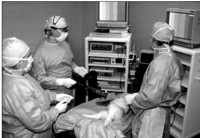
Figure 1. Position of pig and surgical team for endolaparoscopic aortic repair. Pig in the right lateral decubitus position with Trendelenburg positioning. Left to right: scrub nurse, surgeon, assistant. The labeled left costal margin is visible by the assistant's left hand. The AESOP robotic arm is in the center of the field; and the Hermes control system is to the right of the surgeon, who is wearing a voice-activation headset.

The animals were placed in a full right lateral decubitus position (left side up) in the Trendelenburg position ( Figure 1 ). Preliminary measurements were made for