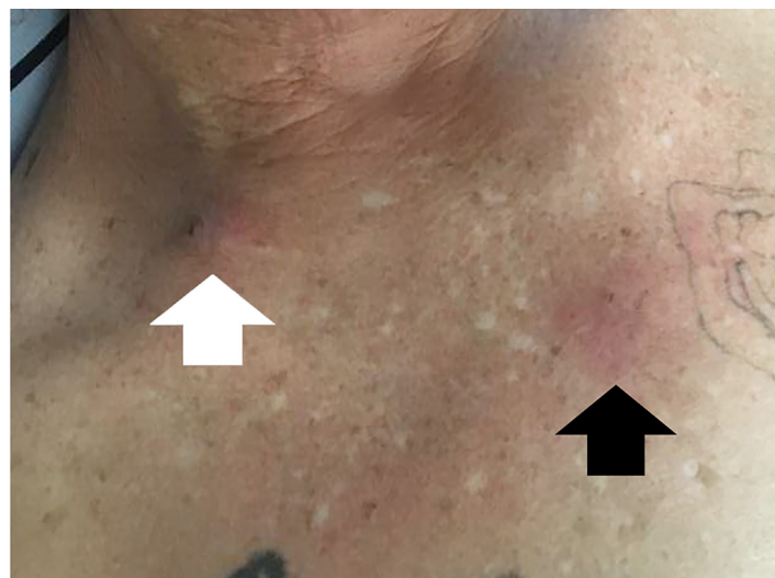
Image 1. Skin findings as seen while the patient is sitting upright (base of neck at top of image). Note the puncture mark within the supraclavicular space (white arrow) and the erythema across the sternum (black arrow).

The preliminary ultrasound report revealed an abscess adjacent to the patient's right sternoclavicular joint (Image 2). A CT of the chest revealed bony destruction of the manubrium