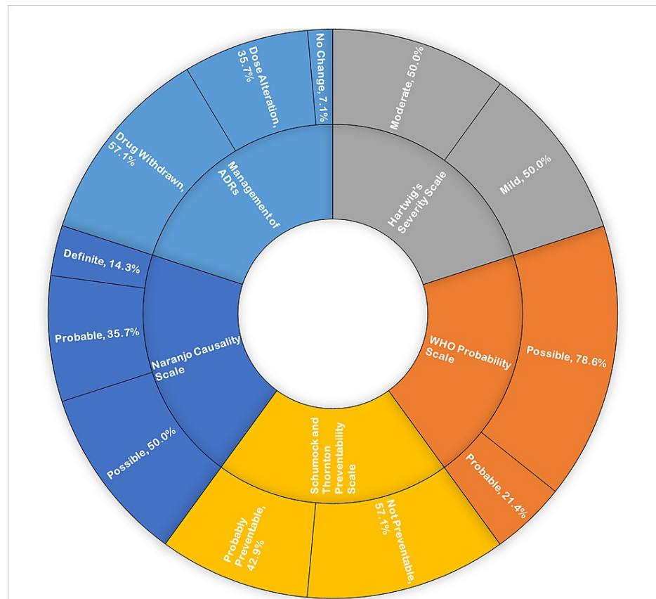
FIGURE 2: Causality assessment and management of suspected adverse drug reactions.

ADRs: adverse drug reactions; WHO: World Health Organization