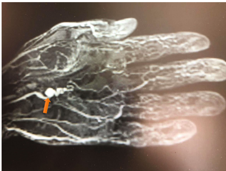
FIGURE 1: Angioresonance showing an aneurysm approximately 7 mm in diameter in the distal area of the ulnar artery, typical “corkscrew” image (red arrow).