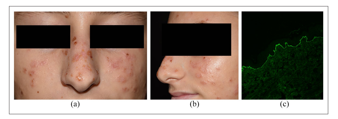
Figure 2. (a, b) Vesicles and blistering lesions on cheeks, nose and forehead in 'string-of-pearls' distributions, with some yellowish crusts. (c) Linear IgA deposition along BMZ at DIF performed on perilesional skin biopsy.