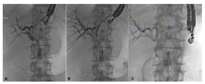
Figure 2 Hepaticogastrostomy (HGS). Patient with pancreatic cancer for more than 1 year and prior ERCP with metal stent placement (stent ends seen at arrows). Now with occluded stent and complete duodenal obstruction due to cancer progression. (A) Transgastric puncture and cholangiogram show indwelling self-expandable metal biliary stent (stent ends seen at arrows) with tumour overgrowth and tumour ingrowth; (B) Guidewire passage into the biliary tree with balloon dilation being performed. Note balloon dilation always begins well distal to the puncture site and progresses proximally; (C) Placement of covered self-expandable metal stent across the HGS (stent ends seen at arrows). A 7 Fr double pigtail was subsequently placed through the SEMS (not shown). Note, the patient underwent endoscopic gastrojejunostomy at the same session following HGS. ERCP, endoscopic retrograde cholangiopancreatography: SEMS, self-expanding metal stents.

Antegrade stenting involves a transgastric puncture into the left intrahepatic biliary system with passage of a guidewire into the duodenum. The track is dilated to allow passage of a stent into the bile duct and across the papilla without creating an anastomosis at the puncture site. There are limited data involving antegrade stenting, though pooled studies have demonstrated an overall technical success rate of 77% and associated AE rate of 5%, including hepatic haematoma and pancreatitis. <sup>15–20</sup> This approach is not commonly used and is generally believed to be inferior to transmural drainage. <sup>8</sup> Reasons