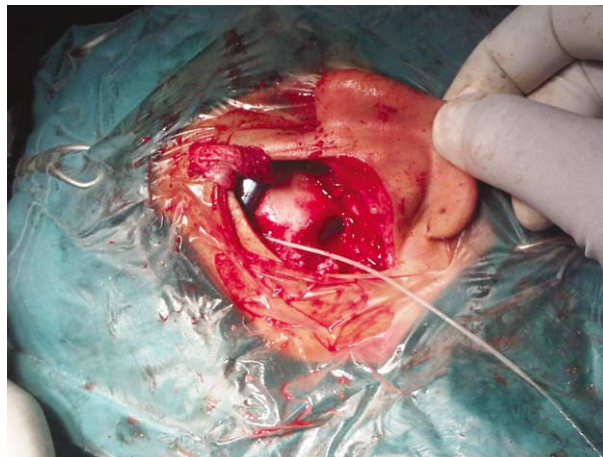
Fig. 1. Post-auricular incision performed with a view of the cochlear implant.

From the outset of the programme, the classical surgical technique for cochlear implantation has been used on all patients. The main steps in this approach include a post-auricular 'C' shaped incision usually made 1 cm from the planned site of the receiver (Fig. 1). The pericranium is raised with the skin flap in order to maintain good vascular supply, as mentioned in previous studies (4). Afterwards, a cortical mastoidectomy is performed and a bed (bony well) is drilled for the receiver-stimulator unit (8). Posterior tympanotomy is then carried out, followed by cochleostomy, which has been enthusiastically adopted by cochlear implant surgeons as it provides good access to the round window and promontory (9). Care and precision is taken not to mistake hypotympanic cells for the round window niche in order to correctly insert the electrode array in the scala tympani, in order to prevent what is considered an unacceptable complication (4). The duration of this operation usually lasts up to 2 hours. All paediatric patients were given intra- and post-operative prophylactic antibiotics (ceftriaxone) against meningitis.