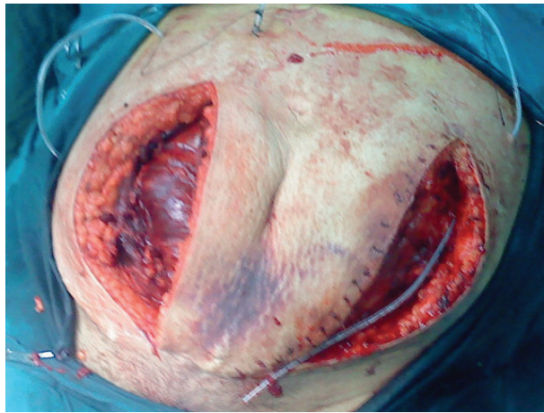
Figure 2. Hematoma Was Opened by Two Separate Incisions