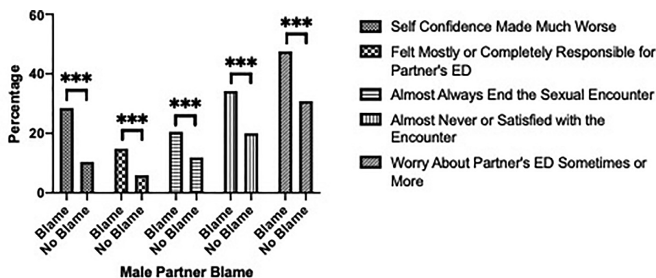
Figure 2. Effect of male blame on female sentiments.