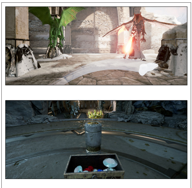
FIGURE 2 | Screen shots of the fantasy medieval world virtual environment.

The HTC Vive has some limitations to be used at home, such as specific hardware requirements. Therefore, the Oculus Quest headset will be used instead, which is a fully standalone headset that includes two ergonomic controllers. The virtual environments have been adapted for the Oculus Quest headset. Since the Oculus Quest headset cannot detect the patient's feet, exercises in which feet had to be identified were modified. Both the HTC Vive and Oculus Quest headsets increase the patient's sense of immersion into virtual environments and allow the system to execute a cause-effect response between exercise storytelling and the patient's response. Both headsets incorporate a system that warn the patient when she/he approaches the physical limits of the rehabilitation area, so that the patient is aware of them.