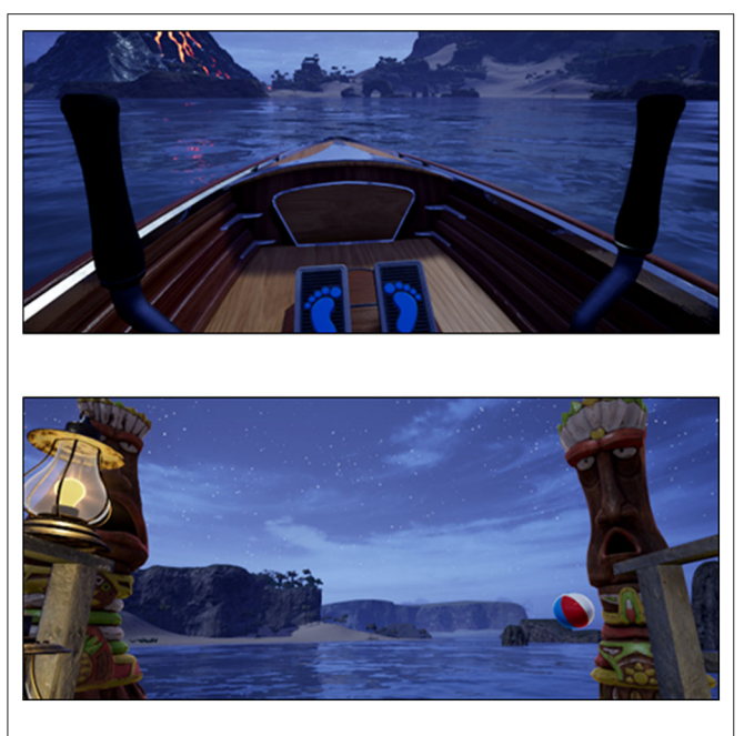
FIGURE 3 | Screen shots of the deserted island virtual environment.

goal explained by Guía (see Supplementary Material 1 ). These avatars will serve as a support tool for patients to conduct the exercises that will be previously explained and supervised by the physiotherapist.