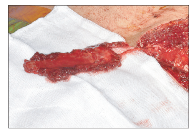
Fig. 3. Ipsilateral fourth rib was harvested. Hyo Won Jang et al: Mandibular condyle and infratemporal fossa reconstruction using vascularized costochondral and calvarial bone grafts. J Korean Assoc Oral Maxillofac Surg 2014

A 3.5 \times 3.0 cm piece of ipsilateral pedicled monocortical parietal bone was harvested (Fig. 2), placed beneath the dura