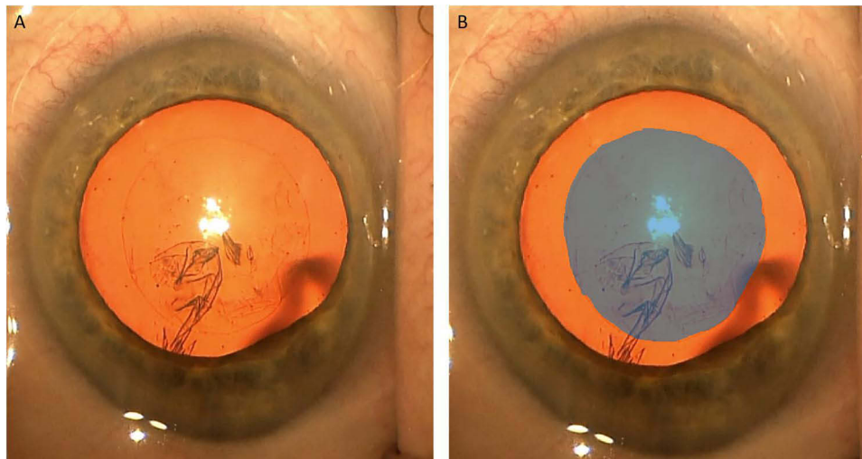
Figure 1 Capsulorrhexis frame before tracing (A) and after tracing (B).

eccentricity – the extent to which the major and minor axes of the completed capsulorrhexis matched. Eccentricity score is high when eccentricity is low.