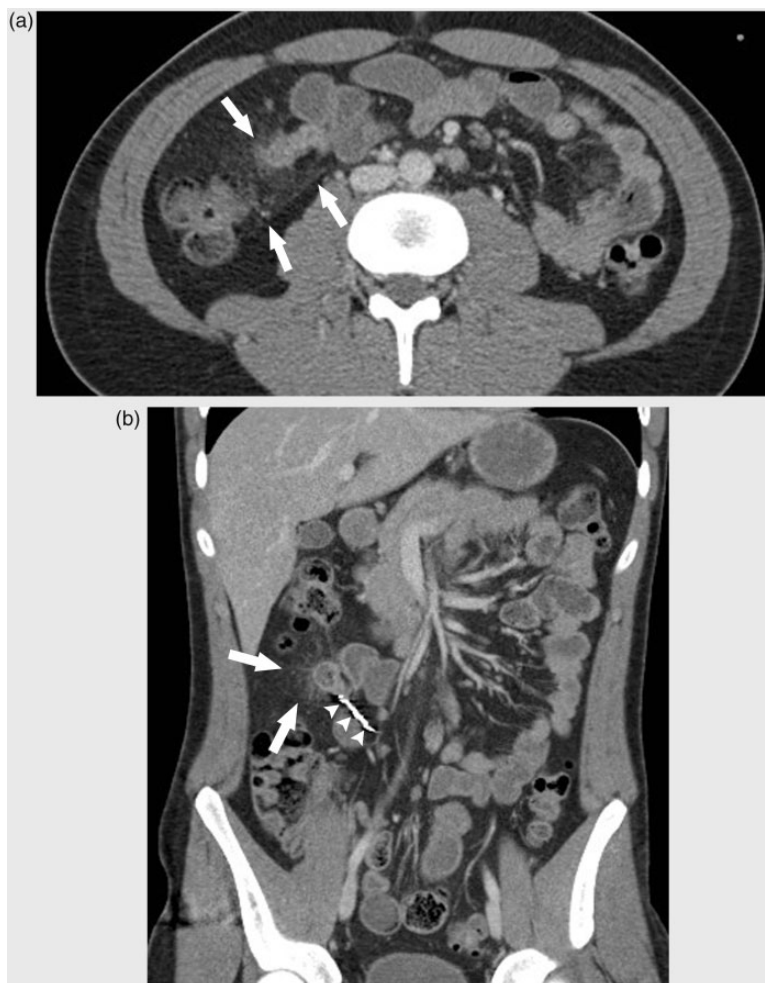
Fig. 2. (a) Thickened blind ending structure originating from the terminal ileum with surrounding infiltration of the fatty tissue: ischemic Meckel diverticulum (arrows); (b) coil in the omphalomesenteric artery (arrows).

The bleeding is most often caused by the formation of a peptic ulcer in the wall of the ileum after the prolonged exposure of its mucosa to the acid secretions of ectopic stomach mucosa in the pit of the Meckel diverticulum. Hemorrhage is the most common complication of a diverticulum of Meckel with a broad clinical spectrum ranging from a slow and occult bleeding to a more dramatic manifestation of bright red rectal blood loss associated with hemodynamic instability (5). Catheter-based angiography is a powerful tool to trace the bleeding point and subsequent transcatheter embolization can stop the bleeding (6). However, in order to see significant blood loss on an angiography a flow of more than 0.5 mL/min is required (4).