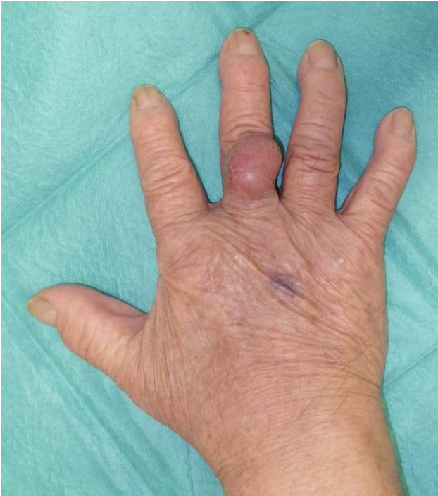
Fig. 1. Preoperative findings of the subcutaneous right-hand dorsum mass.