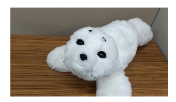
Figure 1. PARO.

administered by trained HCPs. The only research conducted within one's natural environment did not look into the effects of using PARO solely at home as it was a combination of daytime PARO use in a day-care center and home. As PARO can potentially serve as a medium in improving the drive of individuals caring for persons with dementia, it is of benefit to consider PARO use in diminishing stress among family members while contributing to the extension of community living among older persons with dementia, thereby becoming one of the solutions to providing high-quality home care. Description of the solutions to providing high-quality home care.