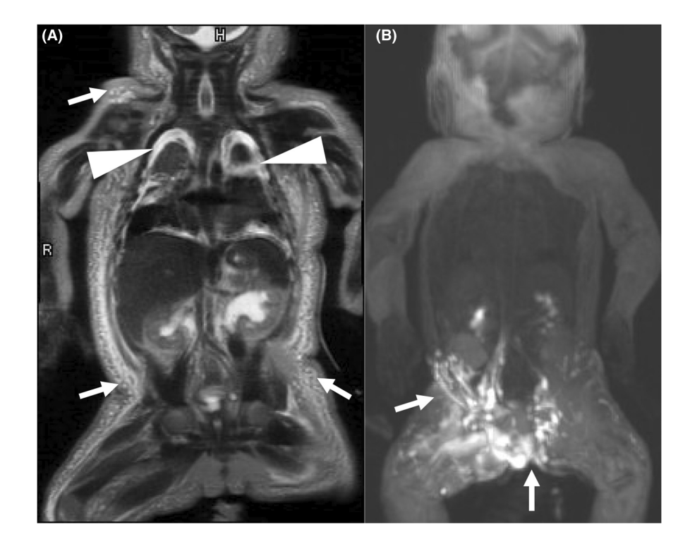
FIGURE 1 Dynamic Contrastenhanced MR Lymphangiography prior to treatment with trametinib. (A) Coronal T2 weighted image, with arrows indicating the subcutaneous edema and arrow heads indicating the pleural fluid. (B) Coronal T1 weighted MR image after intranodal contrast injection. The arrows indicate the dermal backflow of the lymphatic contrast. There is no contrast enhancement of the thoracic duct.

Although therapeutic interventions so far had failed to reduce the chylous effusions, these were continued. Octreotide was discontinued due to national manufacturing problems. Propranolol was started while waiting for approval for treatment with trametinib. After parental consent and formal permission of the Health and Youth Care Inspectorate, treatment with off-label use of trametinib suspension (provided as compassionate use by Novartis Pharmaceuticals as a liquid suspension)