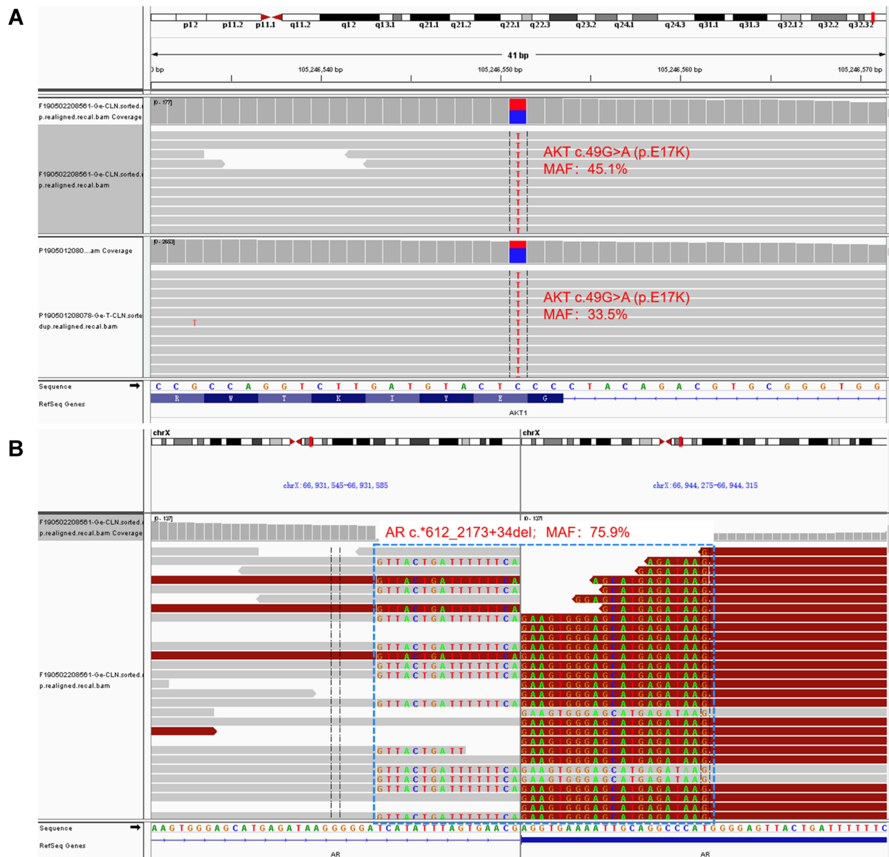
Figure 2 NGS analysis of the lung metastasis and plasma samples. (A) Missense mutation of AKT1 p.E17K in lung tissue and plasma samples. (B) The deletion mutation (c*612-2173+34del) of exons 5–7 and a part of exon 8 of AR in lung tissue.

ADT is the internationally recognized standard treatment for PCa. 9 After 18~24 months of ADT treatment, most