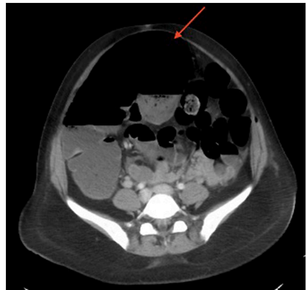
Fig. 2. Computerized tomography (CT) scan of the abdomen and pelvis showing cecal dilation and superior displacement of the cecum (red arrow), concerning for cecal bascule.

First mentioned in 1899, cecal bascule is the rarest form of cecal volvulus, described mostly through case reports in the literature and one systematic review [2]. In the context of obstetrics and gynecology, it has mostly been mentioned perioperatively after cesarean [3,9,10], but was also reported in an antepartum patient [4]. It usually occurs in patients with redundant or mobile cecum, which is a result of incomplete fixation