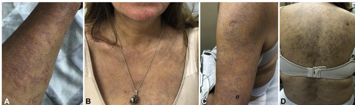
Fig 1. Clinical images. A , Photo from early in the course of the rash. Numerous violaceous papules and plaques resembling a lichenoid eruption. B to D , Numerous scattered coalescing blue-gray macules on the chest, left arm, and back of a patient with hydroxyurea-induced ashy dermatosis. Biopsy sites were marked with a surgical pen ( C and D ).

degeneration and mild lymphocytic infiltration (Fig 2, A and B). The pigment stained positive for melanin with Fontana-Masson (FM) but not for hemosiderin with Perls Prussian blue (Fig 3, A and B), compatible with a late presentation of ashy dermatosis. After a discussion of the biopsy results and treatment options, the patient declined further treatment and opted to monitor the lesion.