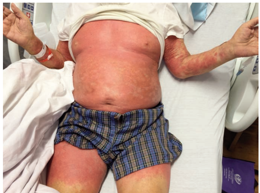
Figure 3. Skin findings on day ten of hospitalization demonstrating reduced intensity of erythema and scaling in response to apremilast treatment.