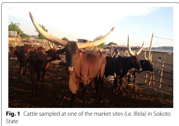
Fig. 1 Cattle sampled at one of the market sites (i.e. Illela) in Sokoto State

or open savanna woodland, with fine- and broad-leaved trees and shrubs, which are deciduous for several weeks [48].