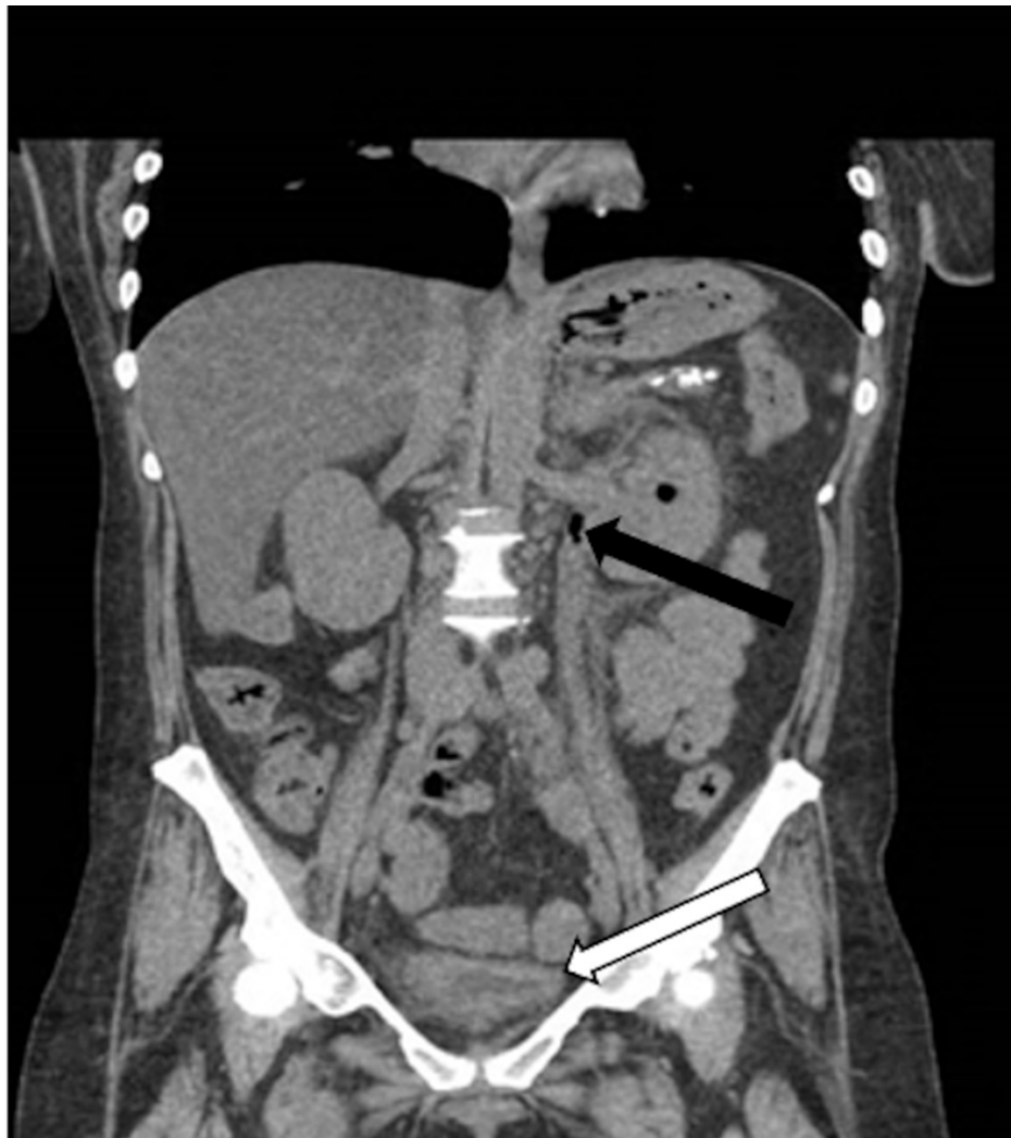
FIGURE 2: CT of the abdomen and pelvis without contrast

Abdominal CT demonstrating gas in the renal collecting system, with the black arrow demonstrating gas in the ureter with hydronephrosis and the white arrow showing thickened bladder wall with perivesicular edema.