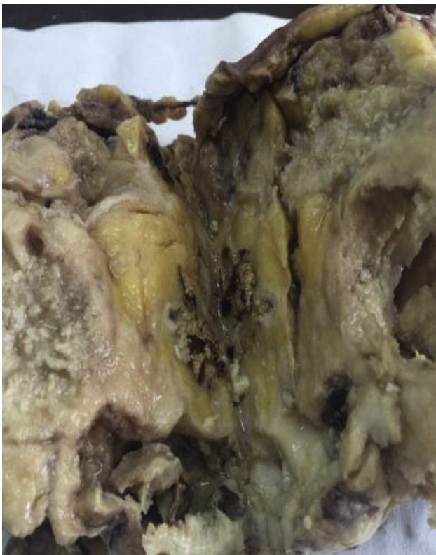
Figure 2. Showing cut section of kidney with stone in calyceal system with gray white solid growth involving whole renal parenchyma.

Due to extreme rarity of the tumor, there is no any standard guideline for the management, however radical nephrectomy may be curative if the disease is localized. 4 Renal SCC is aggressive tumor, most cases usually present at an advanced stage. Therefore, for the treatment of advanced disease, a multidisciplinary approach including surgical treatment along with adjuvant chemotherapy and radiotherapy should be applied, but poor response to surgery, radiotherapy and chemotherapy is the norm, resulting in short survival periods for the most of the cases. 5