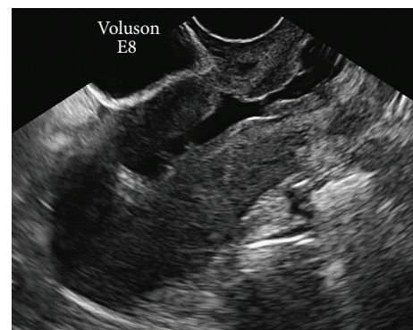
FIGURE 3: Nineteen months after the caesarean section. Saline infusion sonohysterography shows that despite the presence of a 4 mm defect “isthmocele,” myometrium continuity was maintained.