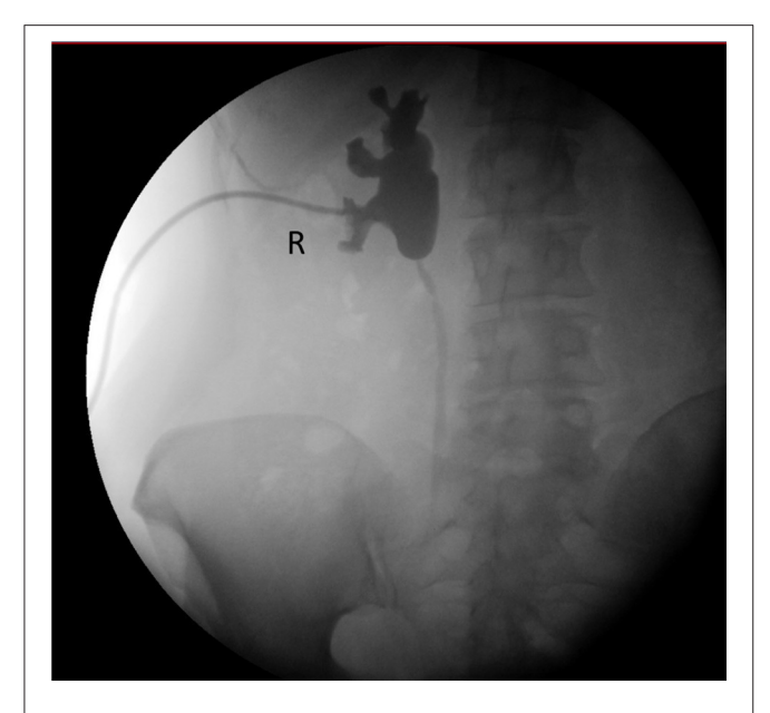
FIGURE 1 | Pre-operative pyeloureterography demonstrating right-side mid-ureteral stricture at the level of the sacro-iliac joint.

a 65° flank position for the nephrectomy phase. A small side support was put in front of the left anterior superior iliac spine to prevent the patient from slipping from the operating table.