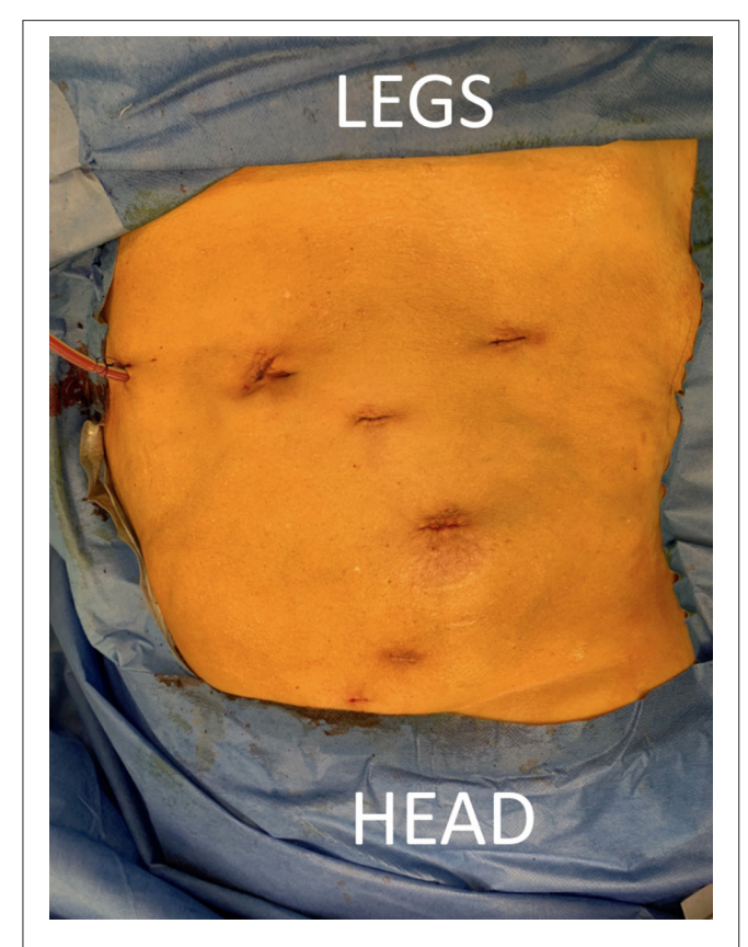
FIGURE 4 | Final result.

computed tomography was performed which demonstrated pulmonary embolism. Therapeutic anticoagulation was started and continued for 6 months (Clavien-Dindo grade 2) (16). Duplex ultrasonography revealed a deep venous thrombosis of the right popliteal vein. The patient already had chronic lymphedema of the right leg pre-operatively which remained stable postoperatively. No further complications were recorded during the first 3 months postoperatively.