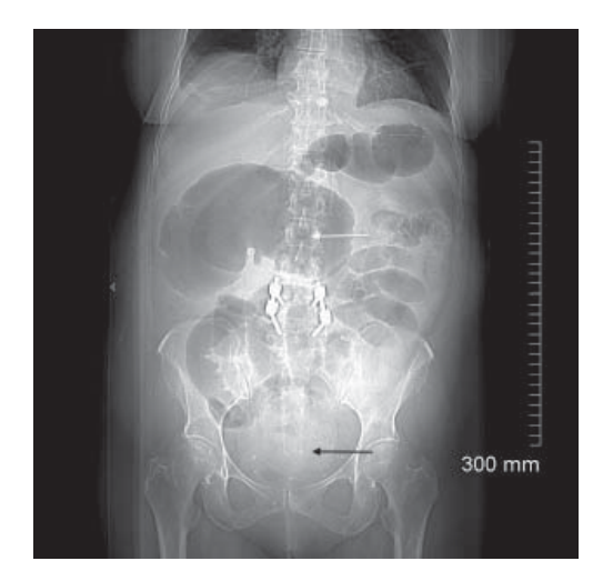
Figure 1. CT scout image demonstrates a dilated cecum in the right upper quadrant producing the classic "coffee bean" sign (white arrow). There are multiple dilated loops of small bowel present centrally within the abdomen with a paucity of gas in the distal colon (black arrow) suggestive of a complete intestinal obstruction. This patient had spinal instrumentation consistent with her previous history of spine surgery.

A 62-year-old female, previously healthy with a remote history of prior lumbar spine fixation and abdominal hysterectomy, was referred for evaluation and management of ileus. She reported ingesting spoiled vegetables three days earlier resulting in nausea, vomiting, and non-bloody diarrhea. She was seen by her family physician and prescribed ciprofloxacin, dimenhydrinate, and loperamide for presumed gastroenteritis. She was not on any other regular medications. Since that time, her nausea and vomiting had resolved; however, she failed to pass any flatus or stool and complained of in-