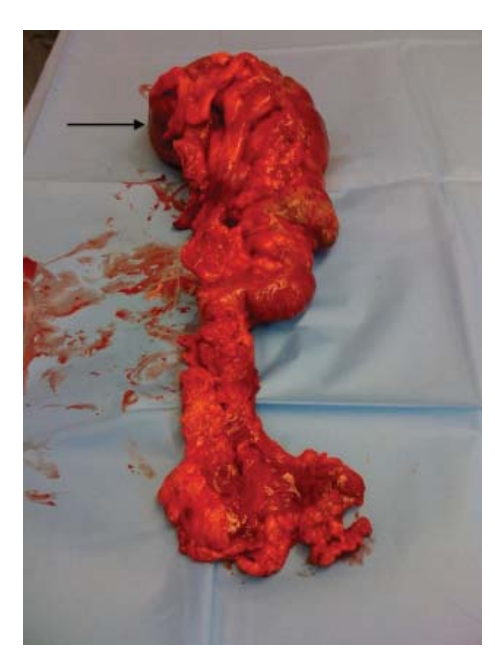
Figure 6. Right hemicolectomy specimen demonstrating areas of intestinal gangrene from closed loop obstruction and ischemic necrosis (black arrow indicates cecum). Pathological examination confirmed the presence of full-thickness intestinal wall necrosis. There were no intraluminal masses identified in the pathology specimen.

dynamically stable. Laboratory work revealed leukocytosis with left shift and abnormal renal function. Plain abdominal films demonstrated diffusely distended loops of bowel with some air fluid levels.