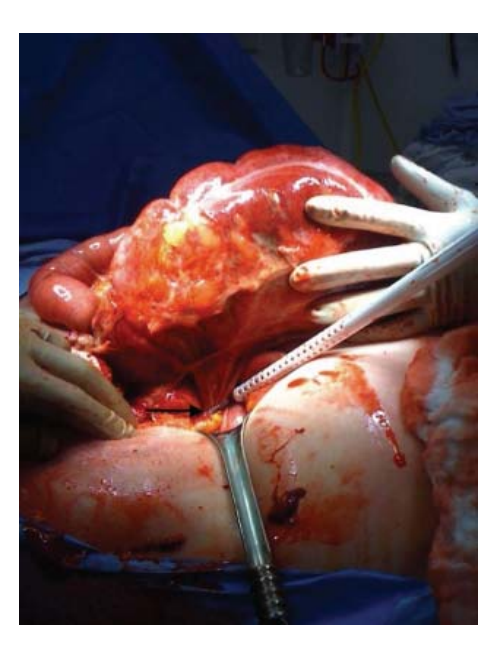
Figure 5. A tubular structure was found to be strangulating the cecal mesentery (black arrow). This tubular structure was gently dissected free and found to originate in the pelvis. The patient had a remote history of abdominal hysterectomy and it was unclear whether gynecological adnexae were concurrently removed. An intra-operative gynecological consult was obtained and the tubular structure was identified as the remnant right fallopian tube and confirmed on pathology. A bilateral salping-opphorectomy was performed.