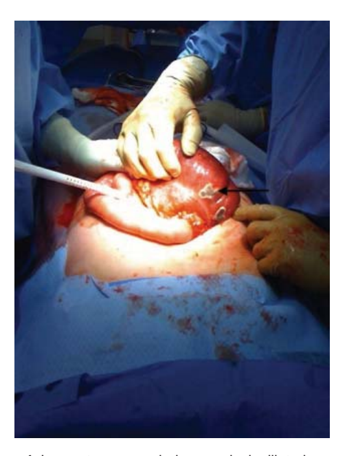
Figure 4. Laparotomy revealed a massively dilated cecum in the right upper quadrant consistent with radiological findings. Turbid free fluid was encountered upon entry into the abdomen. The cecum demonstrated patchy areas of ischemic necrosis (black arrow) and despite carefully twisting it free from its strangulated mesentery, remained unviable. A right hemicolectomy with primary ileocolic anastomosis was performed.