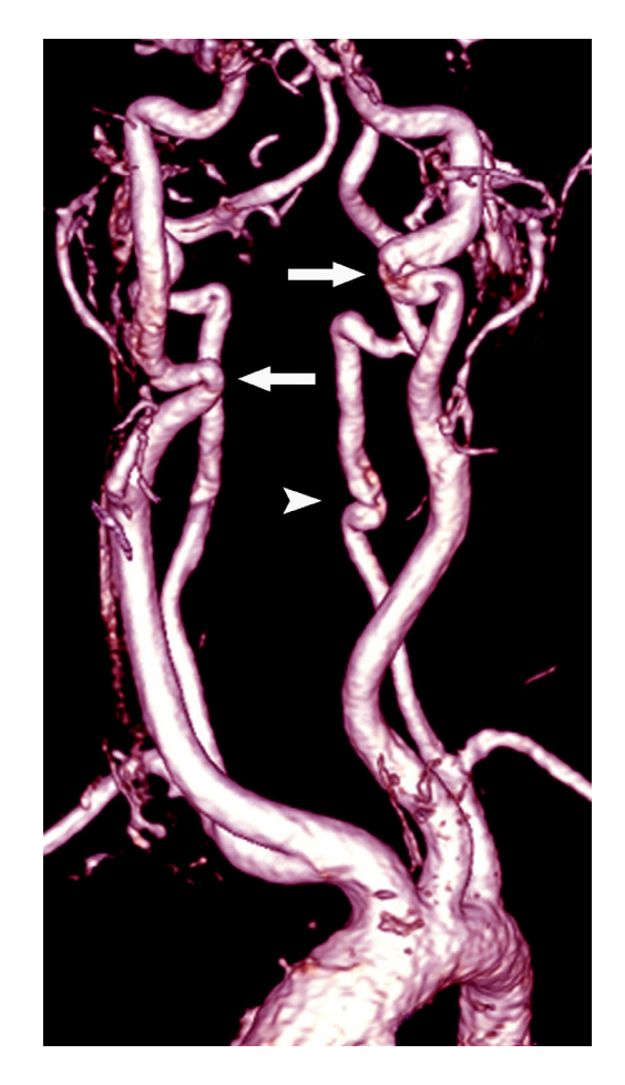
FIGURE 2 Contrast-enhanced MR angiography image using volume-rendering algorithm demonstrates ectasia and tortuosity of both internal carotid (arrows) and left vertebral arteries (arrowhead), especially in their cervical segments

by those vessels. Previous ischemic areas were also observed in the right internal globus pallidum and genu of the internal capsule, as well as in the left midbrain, pons, cerebellar hemisphere, and medial cerebellar peduncle. Laboratory screening for thrombophilia was normal, and her methionine plasma level was normal.