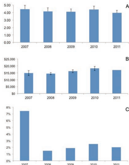
Figure 2. Average length of stay (A), cost (B) and complication rates (C) of total elbow arthroplasty patients in the United States.