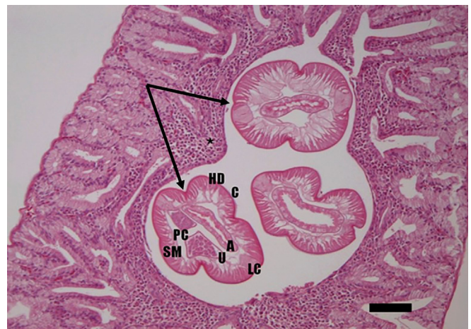
Fig. 1. Histological section of a Northern bobwhite ( Colinus virginianus ) Harderian gland with intraluminal Oxyspirura petrowi parasites in transverse section (indicated by arrows) and marked heterophilic Harderian adenitis. Hematoxylin and eosin staining at 100×, scale = 100 μm * = marked lymphocyte and heterophilic inflammatory cell infiltrate; C = cuticle; HD = hypodermis; SM = somatic musculature; LC = lateral cords; PC = pseudocoelom; A = alimentary tract; U = uterus containing embryonated eggs.

The intraluminal presence of the O. petrowi was associated with a moderate to marked Harderian gland adenitis and fibrosis. In this study, several birds had corneal epithelial erosions and edema