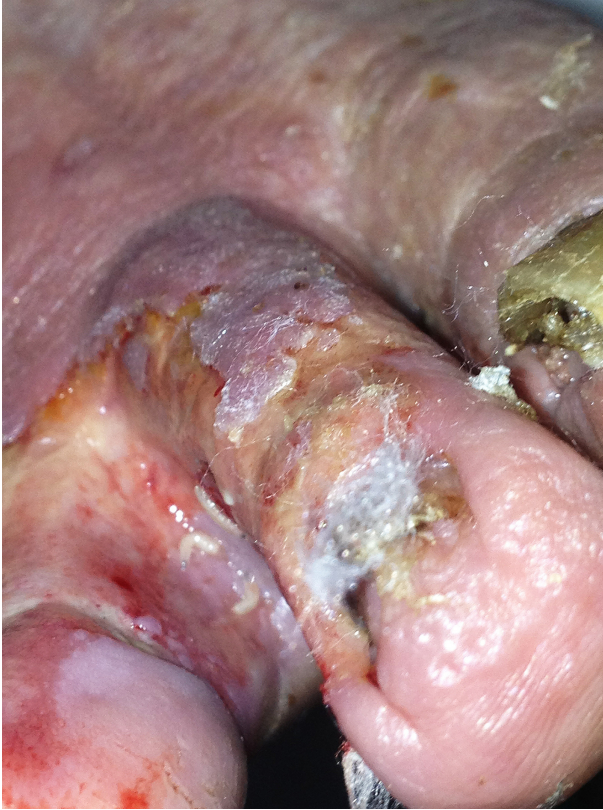
Fig. 1. Maggot-infested wound (between toes).

Dickinson) drawn upon admission revealed growth of Gram-negative rods in one of the aerobic bottles after incubation for 48 h. Upon subculturing of the Gram-negative rod, an oxidase-positive, aerobic, catalase-positive strain was found. Determination by Vitek2Combo with ID-GN card (bioMérieux) revealed Acinetobacter iwoffii with 98% probability. API NE tests (bioMérieux) could not assign the