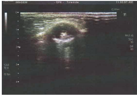
FIGURE 1: Sonography shows an image suggestive of thyroglossal duct cyst containing debris and an eccentric small hyperechoic solid area.

this distinction can play a crucial role in treatment decisions regarding the inclusion of thyroidectomy as part of the treatment strategy versus TDC total resection exclusively [13].