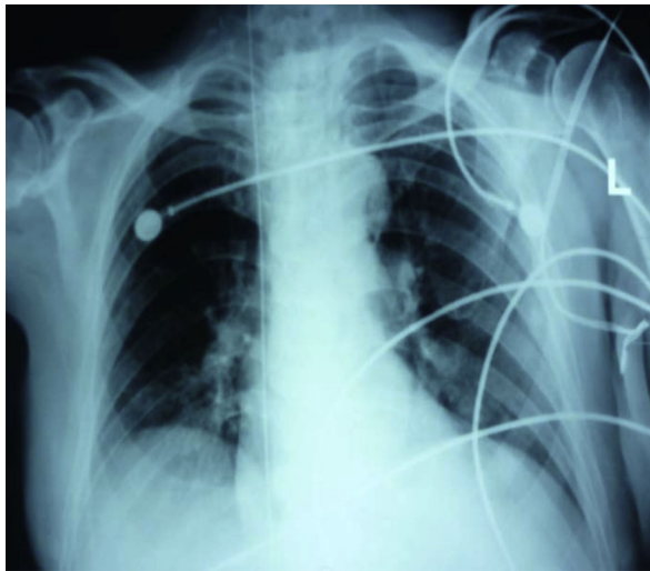
Figure 1 Antero-posterior Chest X-ray revealing the guidewire passing through the internal jugular vein, superior vena cava, right atrium and inferior vena cava.