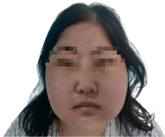
Figure 1. Patient on admission showed her rounded face and swelling of the left cheek.

and abscess formation (Fig. 2). After consultation with the Department of Stomatology, the patient was diagnosed with OMSI combined with abscess formation. Therefore, drainage channels were established at two locations in the buccal mucosa for the treatment of the patient. After repeatedly flushing with saline and diluted hydrogen peroxide solution, yellow pus flowed out of the channels. Thereafter, drainage strips were placed at the drainage sites and changed daily, and the affected locations were adequately flushed locally. On the day of admission, mycophenolate mofetil was discontinued, and the dose of prednisone was reduced to 30 mg once daily. In addition, intravenous antibiotic treatment was administered, comprising oxacillin sodium 2 g twice a day and ornidazole 0.25 g twice a day.