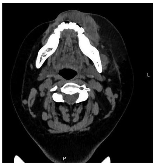
Figure 2. Computed tomography scan of the soft tissue swelling around the mandible before treatment. L, left; P, posterior.

WBC, white blood cell; Hb, hemoglobin; Alb, albumin; 24-h Upro, 24-h urine proteins; CRP, C-reactive protein; PCT, procalcitonin; MPO, myeloperoxidase; ANCA, anti-neutrophil cytoplasmic antibodies; PR3, proteinase 3; C3, complement 3; C4, complement 4; IgA, immunoglobulin A; IgG, immunoglobulin G; IgM, immunoglobulin M; RU, relative units.