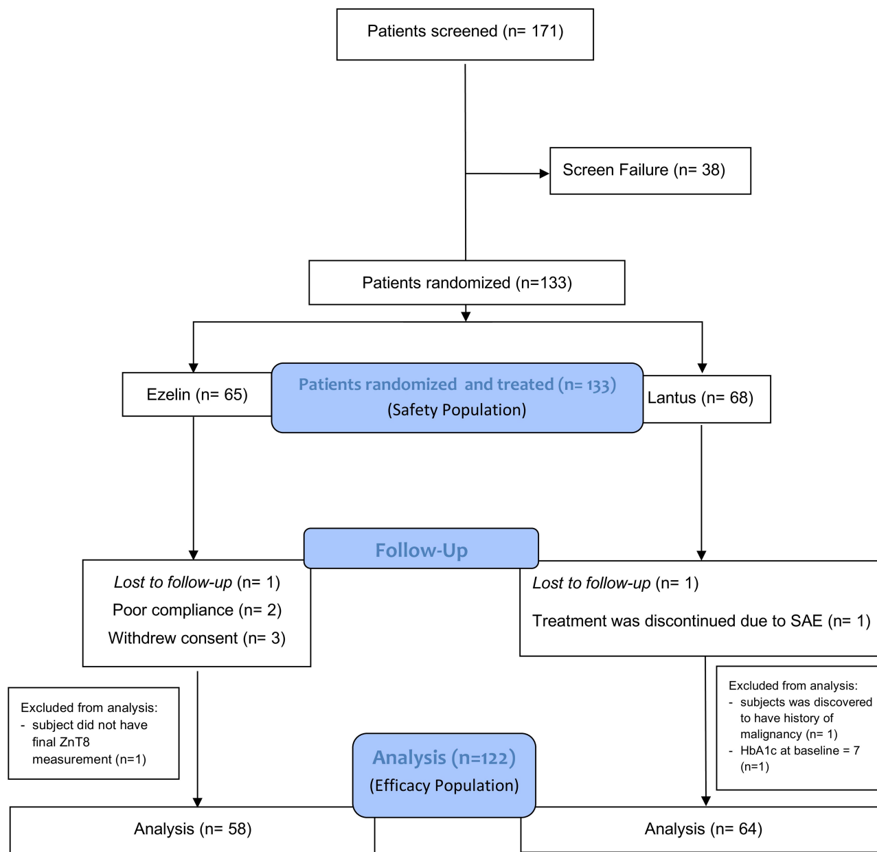
Figure 1 The flow of patients throughout the study.

categorized as SAEs. However, there were 17 cases of suspected cases of hypoglycemia in the EZL group versus 15 cases in the LAN group, without SMBG measurement. No patient in both groups experienced ketoacidosis during the study.