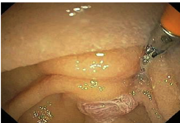
Figure 2. First EGD showing an intact ampulla.