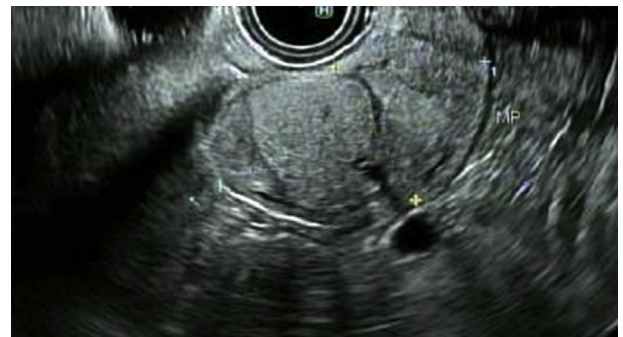
Figure 3. Linear EUS image of a 3.5-cm polypoid mass prolapsing in the second portion of the duodenum. The mass originates from the submucosa (layer 3). The muscularis propria (layer 4) is clearly seen as intact.