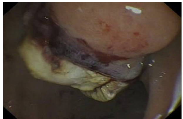
Figure 4. Submucosal fat after resection consistent with Brunner's gland hamartoma.