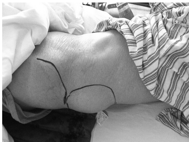
Figure 1. Picture Shows a Lumbar Hernia in the Left Flank

refused the operation to repair the bilateral lumbar hernia. An orthopedic operation to repair the bone fracture was carried out on the third day of admission, when the patient became medically stable, using intramedullary nail fixation after closed reduction of the right extremity, and the patient was discharged from the hospital five days later. This study was approved by the ethics committee of the second affiliated hospital of Wenzhou medical university, and informed consent was obtained from the patient.