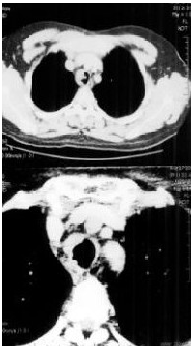
Figure 2 a) Chest CT scan displays a polypoid mass occupying 50 % of the lumen. b) Control CT scan displays resolution of the tumor

The patient underwent adjuvant radiation therapy after the operation. CT scan of the neck revealed resolution of the tumor (Figure 2b). Now, 3 months after the operation, the patient has remained well.