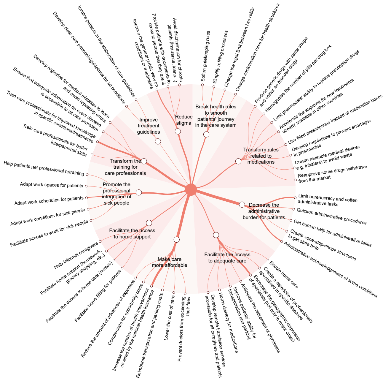
Figure 3 Areas for improvement at the health system level. Line thickness represents the number of participants who elicited the idea.

implemented on a larger scale to guide healthcare policies, although new tools to analyse larger and ever-growing amounts of qualitative data will be required. Although our results were at the small scale, they have already been taken into account by the French government in its consultations in preparation for elaborating the national strategy to transform the healthcare system. 57 Future steps may involve exploring how patients' ideas identified in this study would be prioritised or valued by different groups.