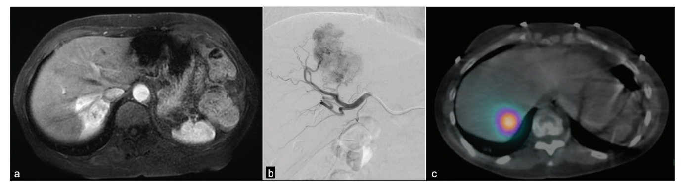
Figure 1: 67-year-old asymptomatic woman with hepatic metastatic renal cell carcinoma who presented with organizing pneumonia after radioembolization treatment. (a) Pre-procedure contrast-enhanced MRI demonstrated conglomerate renal metastases in segments 7 and 8 adjacent to the diaphragm. (b) Catheter angiography demonstrates hypervascular metastases supplied by three arterial conduits. (c) Postradioembolization bremsstrahlung SPECT/CT demonstrates activity within the targeted angiosomes covering both tumors and a margin.

emission tomography-computed tomography (PET-CT) demonstrated new bibasilar mixed peripheral airspace consolidation with central ground-glass opacities compatible with a reversed halo sign (atoll sign) highly suggestive of organizing pneumonia [Figure 3b]. The findings were reviewed by the interventional radiology, chest imaging, and nuclear medicine teams, as well as her local pulmonologist, and a working diagnosis of OP was established given the patients lack symptoms. Similar to the pathophysiology of EBRT derived OP, it was suspected that the margin generated by higher energy Yttrium 90 beta particles emitted from the hepatic dome irradiated the adjacent lung and stimulated the development of OP in the lower lobes. The patient chose to pursue conservative management without steroids. A chest CT 8 months after radioembolization demonstrated nearcomplete resolution of OP [Figure 3c]. The patient continues to remain asymptomatic and has shown no signs of tumor recurrence 10 months after radioembolization.