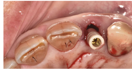
FIGURE 3: Implant placement.

periotomes, was used. After using periotomes, teeth were carefully extracted by means of extraction forceps (Figure 2). Then, following tooth extraction, the surgeon carried out the debridement of the adjacent tooth surfaces and removed granulation tissue by the use of hand instruments and sterile saline rinses. The socket walls were inspected to exclude the presence of fenestration or dehiscence defects. All extraction sites had intact bone walls and received bone-level implants (Straumann Dental Implant System, MIS Implants) which were positioned in a lingual/palatal position (Figure 3) and a bone xenograft (Bio-Oss®; Geistlich Pharma AG, Wolhusen, Switzerland) was packed in the gap. The implants were placed with the shoulder located 3 mm apically from the line connecting the cemento-enamel junction (CEJ) of the surrounding teeth. In all cases, primary implant stability was reached. In the SCTG group, a subepithelial connective tissue graft with a width slightly greater than the mesiodistal width of the recipient site and a thickness of 1.5 mm was taken from the palate and was positioned supraperiosteally in the buccal area using