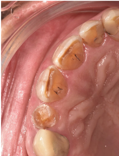
FIGURE 1: Preoperative clinical situation.