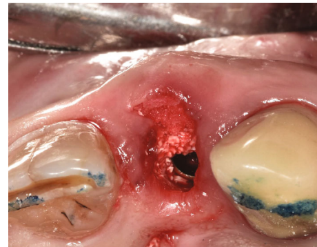
FIGURE 4: Soft tissue augmentation using the xenogenic collagen matrix.

a tunnel technique. The tunnel technique was performed by raising a split flap in order to create a bilaminar envelope and avoiding an incision of the interproximal papillae. The graft was stabilized using vertical and horizontal mattress sutures (5-0 vicryl; Johnson & Johnson Gateway, Piscataway, NJ, USA). In the second group, the same augmentation procedure was performed using XCM, which was sectioned in order to obtain an adequate thickness (Figure 4) (Fibro-Gide; Geistlich Pharma AG, Wolhusen, Switzerland). In the third group, patients did not undergo surgery to increase soft tissue. In each group, the wound closure was obtained with 5-0 PTFE sutures (Omnia Srl, Fidenza, Italy). A temporary abutment was customized with flowable light-polymerizing acrylic resin and placed onto the implant. All of the implants were restored immediately with screwed temporary crown avoiding all centric and eccentric contacts with the opposing dentition. The provisional restorations had an emergence profile designed to help the growth of the soft tissues, protect the blood clot and the particles of the graft.