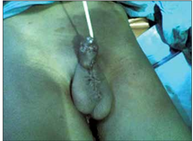
Figure 4: Post operative photograph with urethral catheter in-situ

Paediatric urethrocystoscopy for better definition of the UD was not available at our centre. Antibiotic and wound dressing treatment are ineffective, and other treatment such as diathermocoagulation or the injection of caustic substance into the accessory duct have been condemned and abandoned. [5] The surgical treatment would depend on the type of urethral duplication and associated malformation. All effort should be made to preserve the sphincter.