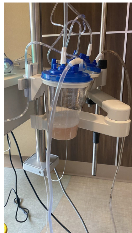
Figure 2. Image showing the secretion burden from the bronchorrhea.

exceeding 1000 mL/d (Fig. 2). Diuresis was started along with broadening of her antibiotics which did not significantly affect the volume of secretions. She failed daily spontaneous breathing trial attempts, primarily believed to be secondary to her copious secretions, which also precluded any further weaning. A diagnosis of bronchorrhea was made, resulting from her recently diagnosed mucinous adenocarcinoma and was believed to be the primary cause of her persistent hypoxemia at this