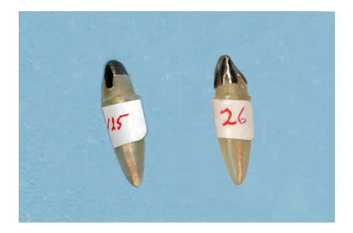
FIGURE 5: Specimen of cemented cast post in each group.

2.3. Post and Cores Fabrication. Gates Glidden drill number 3 (Dentsply Maillefer A0008 240 00500) and 1.1 mm Largo (Dentsply Maillefer A0008 230 002 00 to A0008 230 003 00) were used to prepare the post spaces, leaving 7 mm of apical seal. Post and cores were constructed using 1.25 mm burnout plastic posts coated in increments with wax patterns to fit the root canal. For the coronal fabrication, a silicone index of the intact tooth and wax were used to standardize the coronal dimension for all specimens. The bevel at the coronal part in group 2 was filled by wax patterns thus becoming a part of the post and core (Figure 4). The post and cores