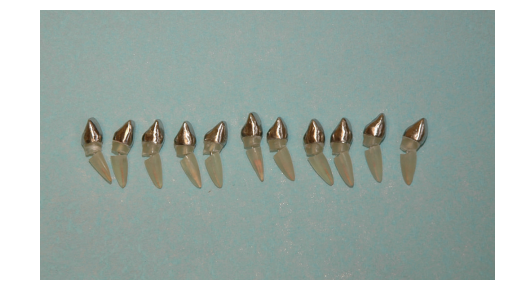
FIGURE 9: Fracture line visualized after testing in all specimens.

Incomplete seating of posts for all specimens of group 2 was the first result noticed before fracture testing (Figure 8). Another finding is that all analogues failed with the same