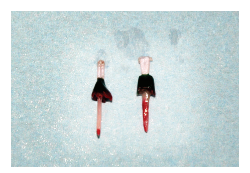
FIGURE 4: Specimens of post and core fabricated with wax patterns.

ferrule was left at the proximal sides. Group 1 was considered as control group without modifications, while group 2 was obtained by changing the axis of the analogues to 24° and the facial and palatal walls were prepared to create an external bevel 30° to the long axis of the tooth (Figure 3).