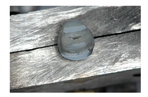
FIGURE 2: Coronal preparation for full coverage crown in both groups.

teeth, the antirotary resistance form, realized by the contra bevel, could modify the load direction and stress distribution within the post/dentin system.