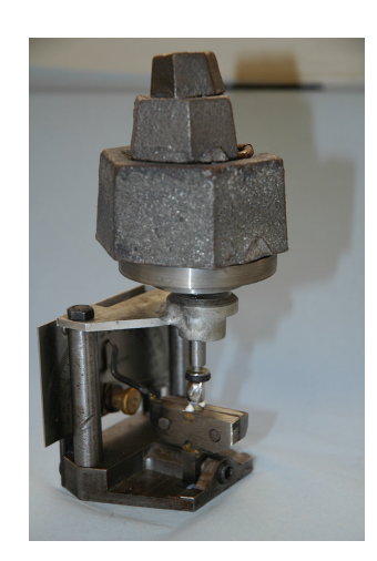
FIGURE 6: Cementation of a crown under static load.

were cast in a Ni-Cr alloy and cemented using spiral paste filler (Dentsply Maillefer Instrument) under a static load 1.5 Kg for a duration of 15 min with zinc phosphate cement (spofaDental Adhesor®) (Figure 5).