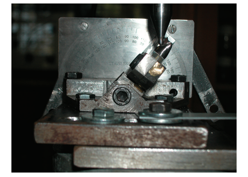
FIGURE 7: Simulating clinical direction in class I occlusion for testing.