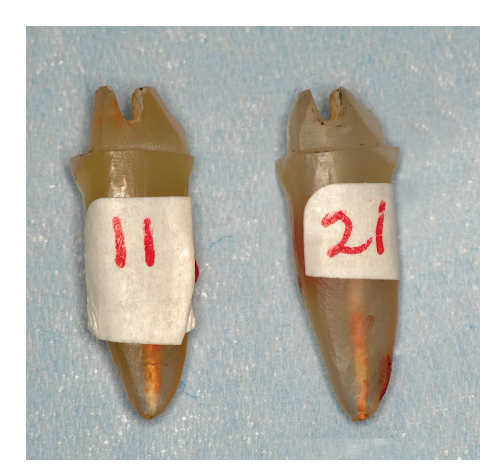
FIGURE 3: Specimen of each group showing the prepared contra bevel in group 2.