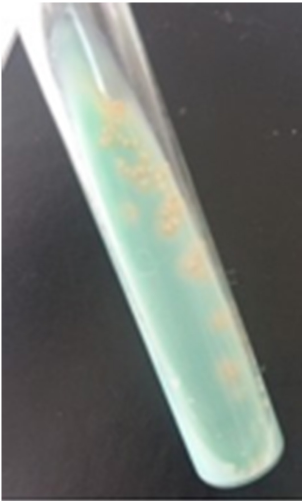
Fig. 2. Beige verrucous colonies of M. tuberculosis on Lowenstein-Jensen medium.

The treatment consists of percutaneous or surgical drainage combined with antituberculous treatment for a minimum of 12 months, combining rifampicin, isoniazid, ethambutol and pyrazinamide for 2 months, followed by 10 months of rifampicin and isoniazid.