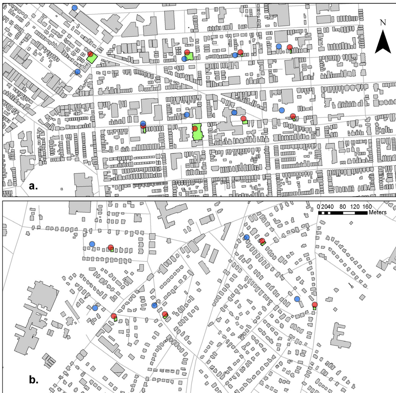
Figure 3 Results of reversely identifying patient addresses in Boston, Massachusetts. The green buildings are the randomly selected patient locations. The blue points are the predicted locations of the cases from the presentation quality map (50 dpi) and red points are predictions from the publication quality map (266 dpi). Proximities of the predicted to the actual location are displayed for both (A) a high density urban area and (B) a low density suburban area.