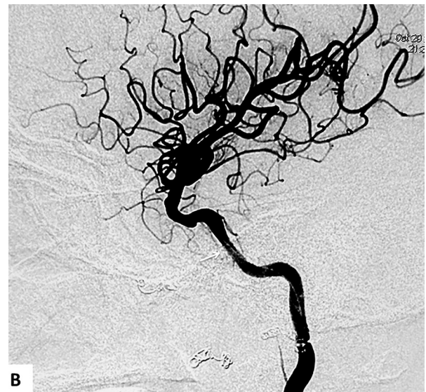
Fig. 2 – Digital subtraction angiography immediately after stent graft placement shows total obliteration of the pseudoaneurysm with patency of ICA (white arrow).