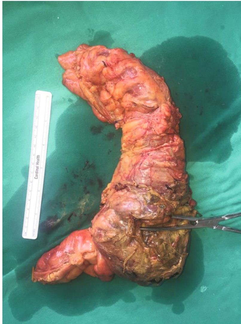
FIGURE 3: The right hemicolectomy specimen as it appears from the posterior side. A clamp is placed on the site of the perforation.

The most common causes of retroperitoneal abscesses are infections of the duodenum, pancreas, terminal ileum, appendix, and ascending and descending colon. Retroperitoneal abscesses, in addition, may result from microbial agents such as tuberculosis, Staph. aureus , E. coli , Bacteroides species, or other rare bacteria, such as the Actinomyces species [16]. Since cecum (in the case of distal obstructing cancer) usually perforates most often on the anterior longitudinal axis [13], it is not surprising that there is only one more case report of a retroperitoneal diastatic cecal perforation, which manifested however as subcutaneous cervical emphysema and pneumomediastinum, and not as a retroperitoneal abscess [17].